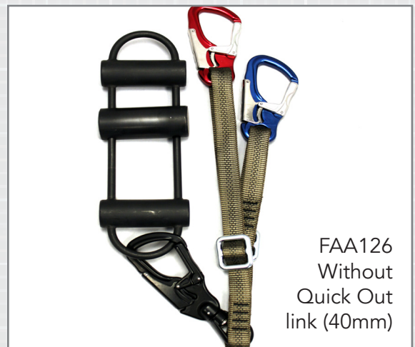
FAA126 Without Quick Out link (40mm)