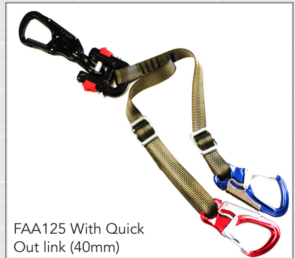
FAA125 With Quick Out link (40mm)